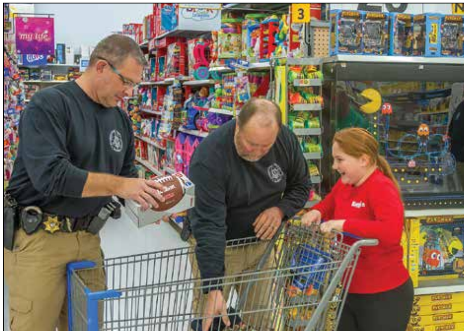
Wyandotte Nation officers help provide gifts for area children as part of the annual 'Shop With a Cop' program.