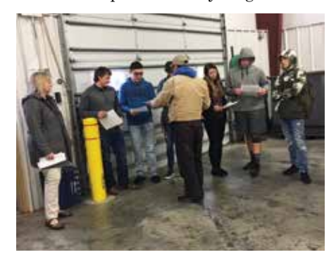
Continued on Page 10

On Jan. 29, environmental staff were able to take part in a Recycling Educa-